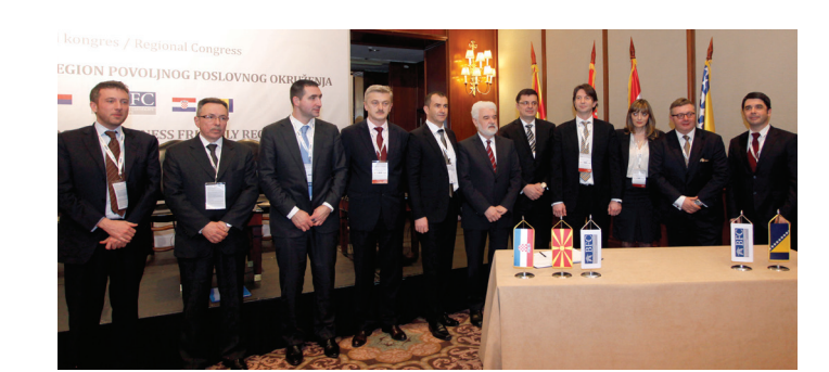
Partnership for a competitive region: ministers, mayors, businesses, leaders of the international community and the Prime Minister of Serbia at the first BFC SEE congress, Belgrade 2012