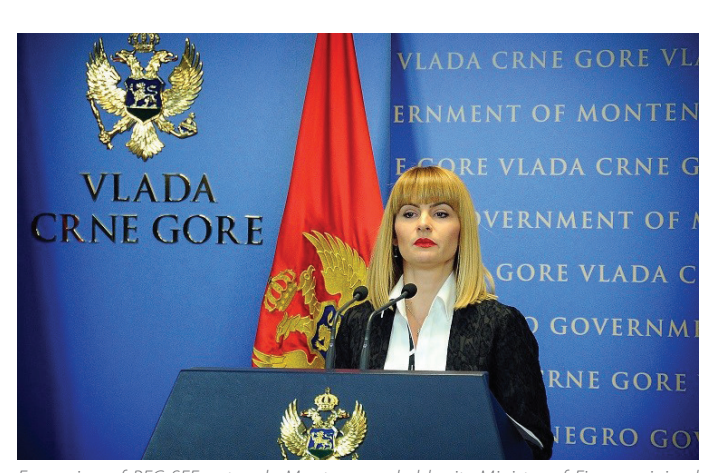
Expansion of BFC SEE network: Montenegro, led by its Ministry of Finance, joined Bosnia and Herzegovina, Croatia, Macedonia and Serbia, Podgorica 2016