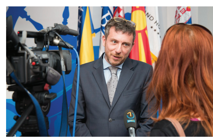
International support: GIZ Open Regional Fund financed by the Governments of Germany and Switzerland announces further cooperation with the BFC SEE network, Neum 2015