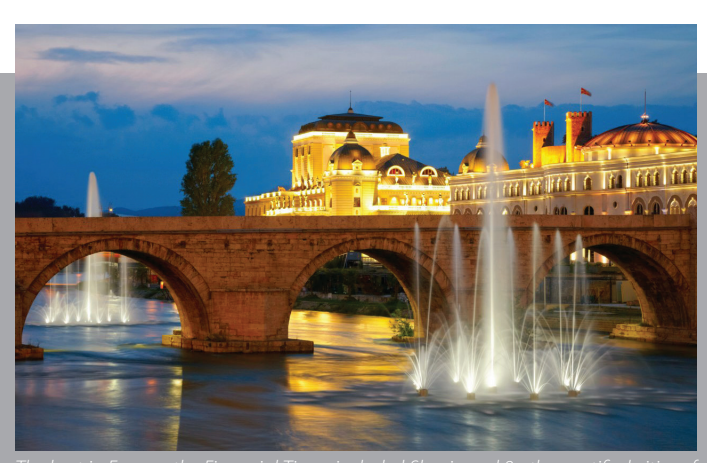
The best in Europe: the Financial Times included Skopje and 8 other certified cities the region, in its fDi list of top investment destinations, Cannes 2016