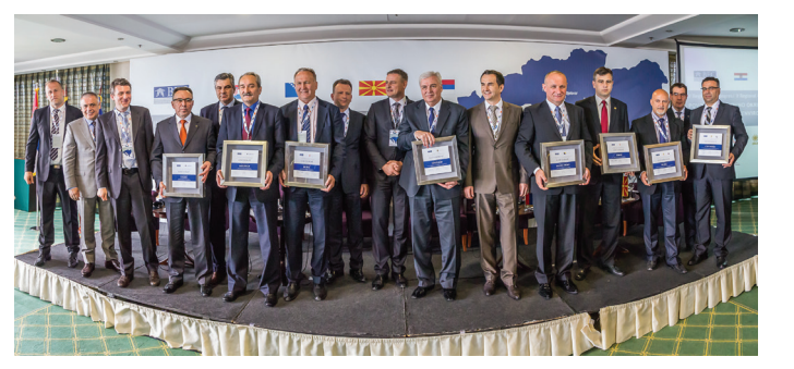
Business-friendly municipalities: BFC SEE certificate award ceremony to the best local governments in South East Europe, Zagreb 2013